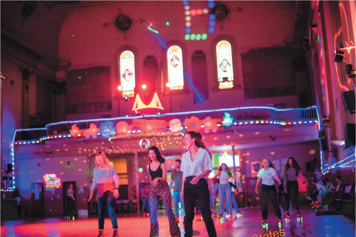
Skaters make their way around the rink while classic disco and soul plays at the Church of 8 Wheels in San Francisco on Sept. 20, 2022.

cited in Apache Stronghold v. United States No. 21-15295 archived February 27, 2024