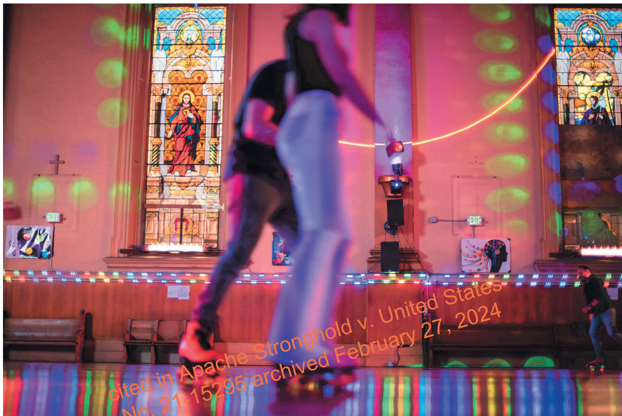
Skaters make their way around the rink while classic disco and soul plays at the Church of 8 Wheels in San Francisco on Sept. 20, 2022.

The novelty of this experience left her wondering: When did the building go from being an active church to a roller-skating rink?