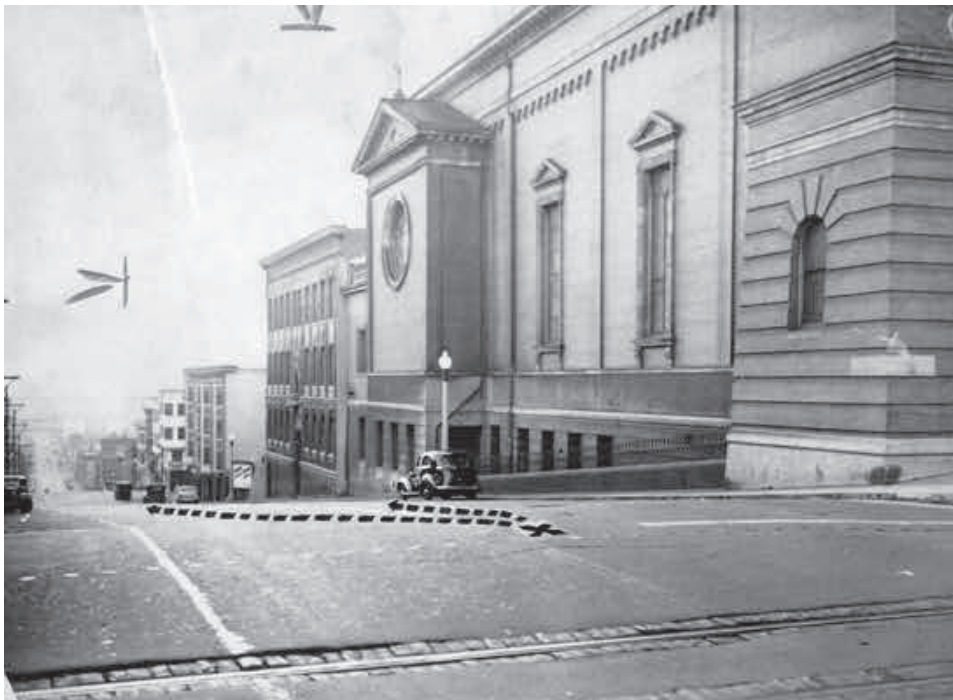
Sacred Heart Catholic Church, on the corner of Fell and Fillmore streets in San Francisco, 1939.

In 2004, the Archdiocese of San Francisco announced the church would be closed, due to the high cost of seismic repairs. The property was sold to a private buyer . The building has since been designated a historic landmark in the National Register of Historic Places.