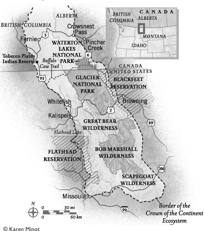
Figure 2. Crown of the Continent

ists continued promoting the area's unique features, and finally, in 1910, President William Howard Taft signed a bill creating Glacier National Park, which borders Waterton Lakes National Park, created by Canada in 1895.